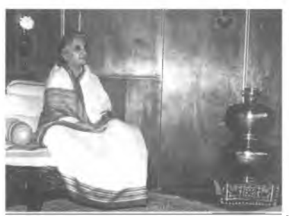
Flam Of Freedolip 9