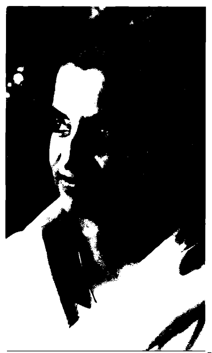
the Oftenson 57